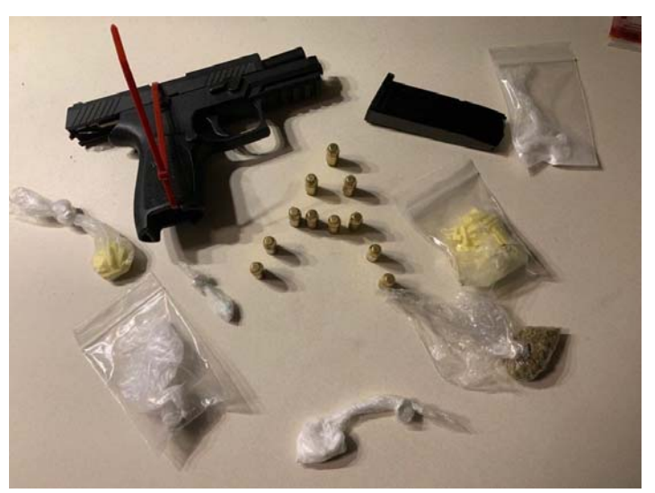
Seized gun and drugs.

possession. Hughes, who has prior cocaine and Schedule V1 drug possession convictions, is being held in lieu of $100,000 bond.