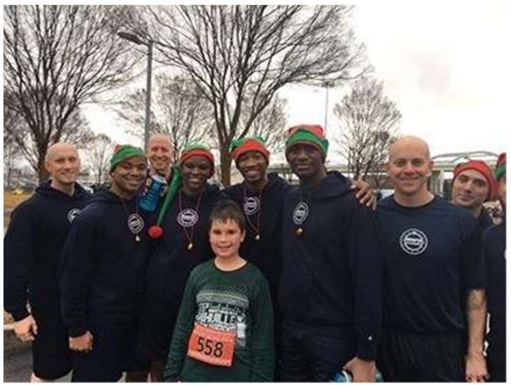
This young man's family wrote to thank the training class for cheering him on!